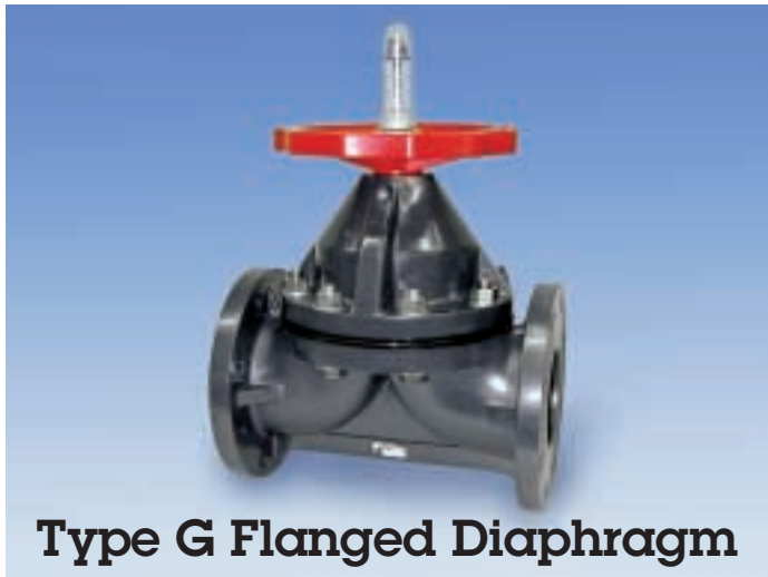
Type G Flanged Diaphragm